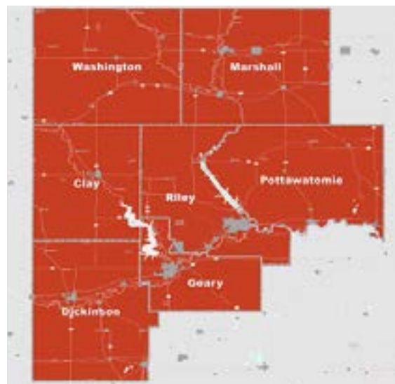
Flint Hills Coordinated Transit District

FHRTA received $517,902 in Federal and State Funds between August 2016-August 2017, local match was $6,420.