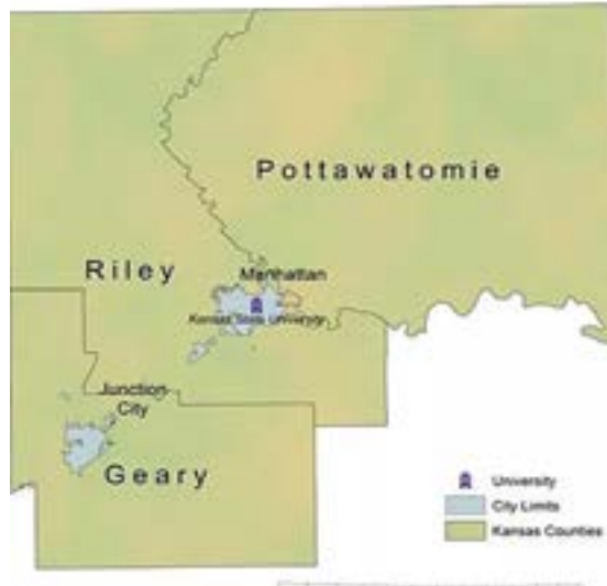
Flint Hills Regional Transit Administration

FHRTA received $517,902 in Federal and State Funds between August 2016-August 2017, local match was $6,420.